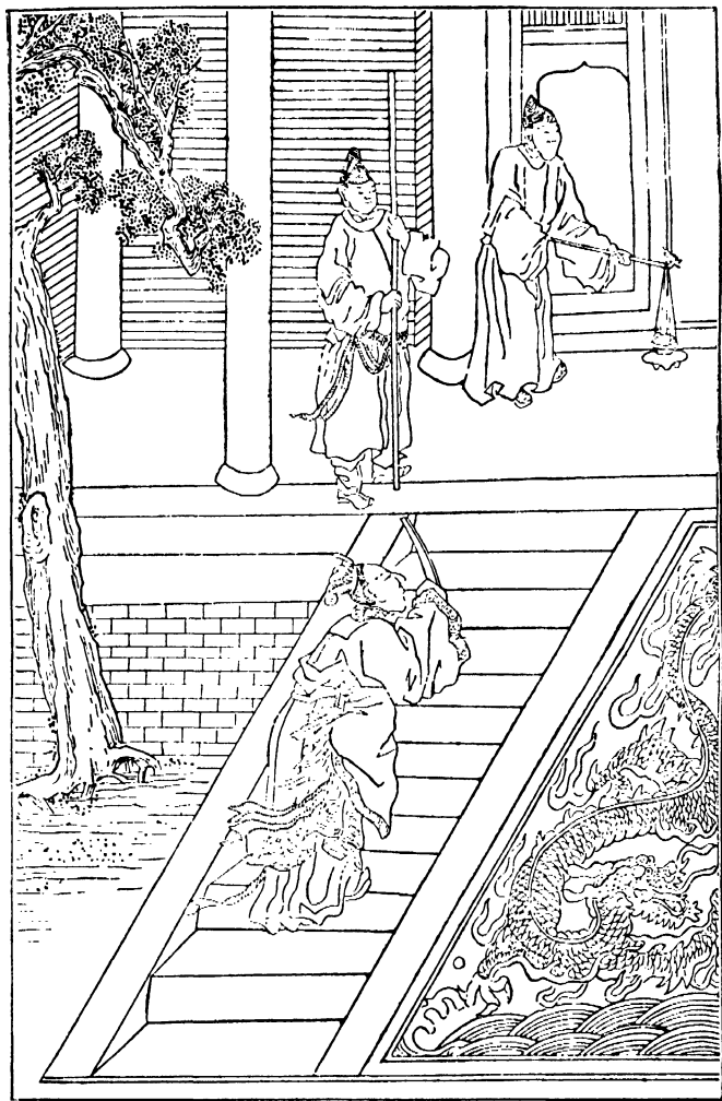
“He raised the jade tablet.” [Chapter 10, verse 4]